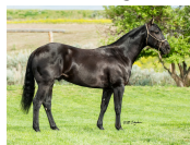
PLAYIN CATTY 33