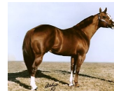
The Country Girl